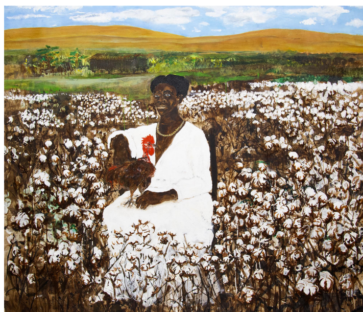
Caption | René Tavares, "This Land Belongs to Us", 2023 Oil, pigment, charcoal, and acrylic on canvas, 175 x 205 cm

HIGH-RESOLUTION IMAGES: https://home.mycloud.com/action/share/fe69dc72-5e79-4872-9db1-9bf9396c2389