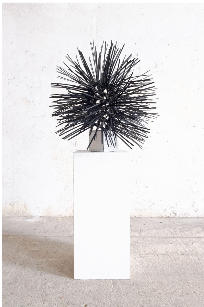
Caption | Antifragility - expansion #1, 2021, Metal and Plastic, 70 x 75 x 70 cm

The gallery has already presented numerous exhibitions in Angola, South Africa, France, Italy, the UK, and Portugal but continues to expand and develop its connections worldwide.