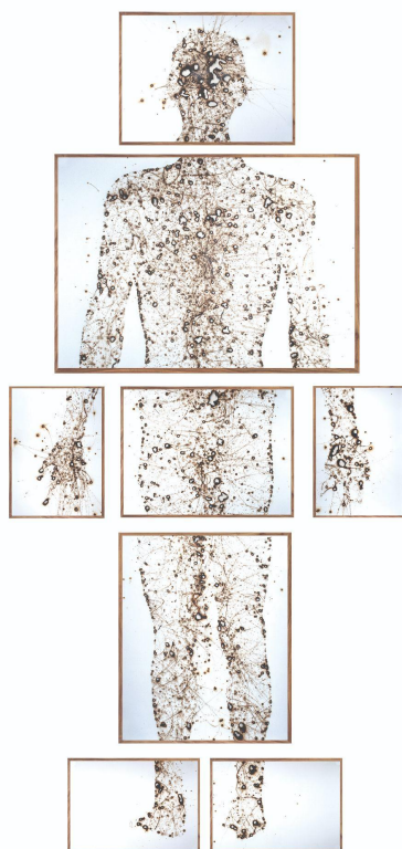
Caption | Fractional, 2022, Sculpture on paper, 196 x 90 cm HIGH-RESOLUTION IMAGES | https://photos.app.goo.gl/yHdFVPXjghUWuS1A6